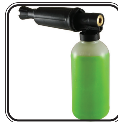
Foam Applicator Bottle