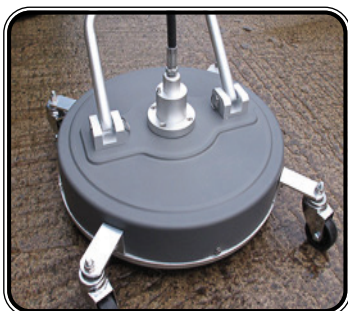
Poly Rotary Floor Cleaner