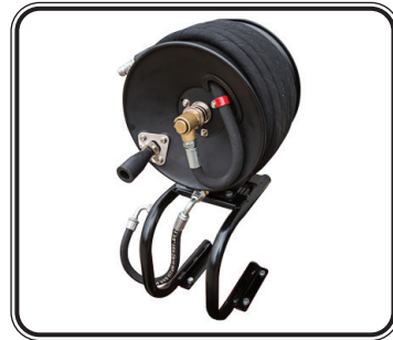
20m Hose Reel kit