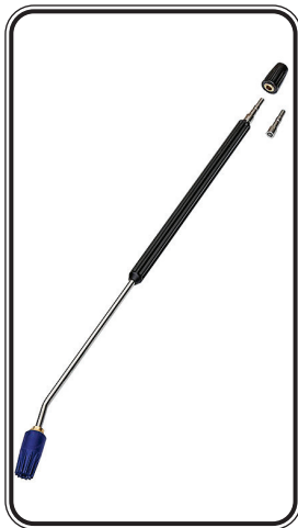
Turbo Lance Kit (900mm or 1200mm)