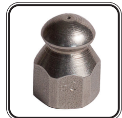
Drain Cleaning Nozzle