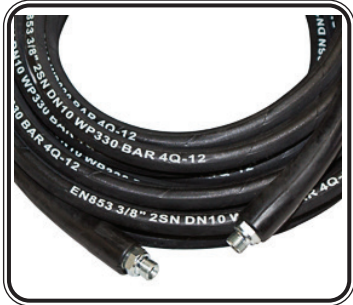
High pressure hose extensions (10m,15m, 20m, 30m, 40m)