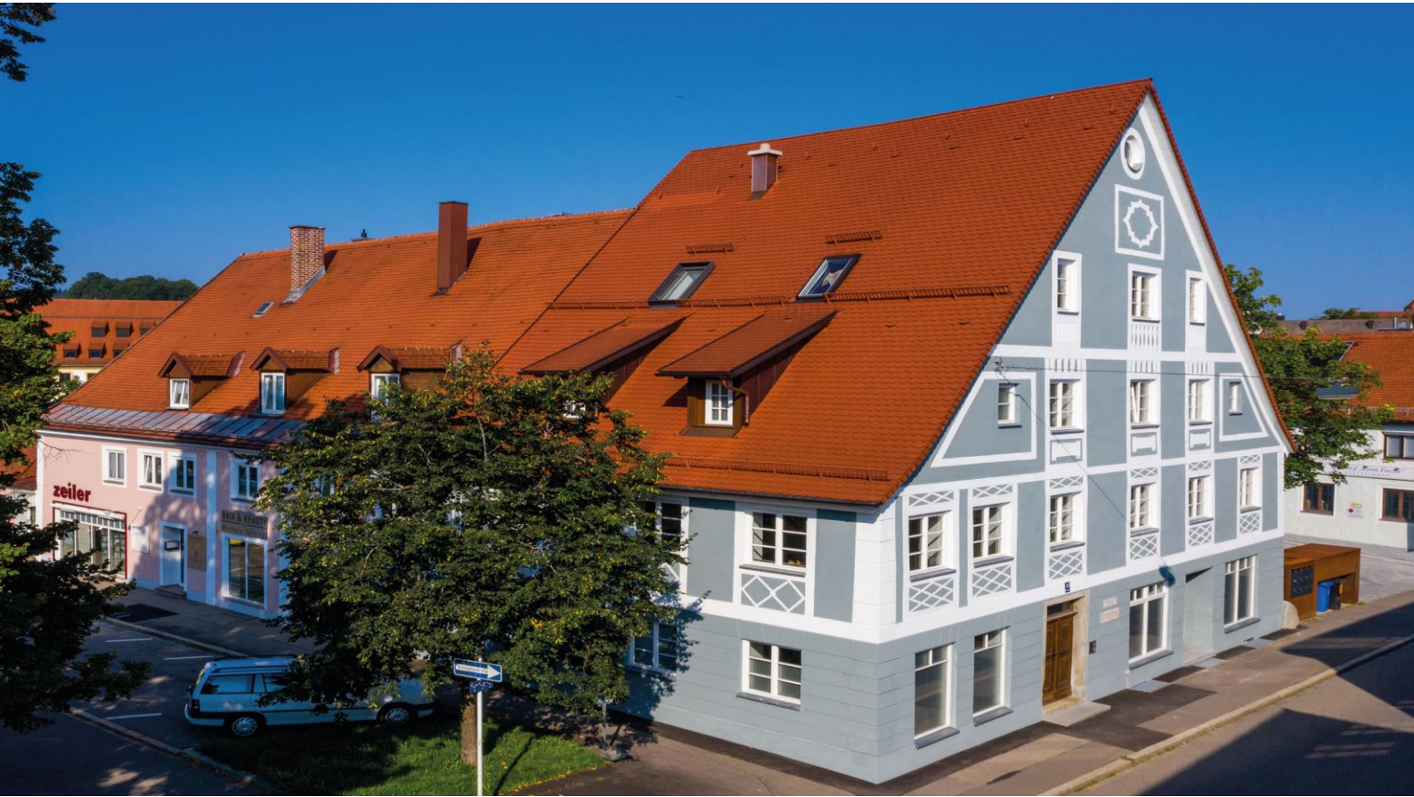
Figure 1: The site of the installation