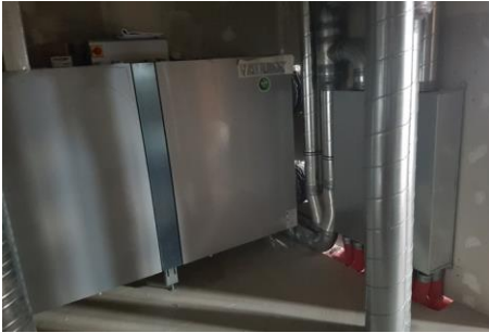
Figure 2: Standalone MVHR unit

The single main MVHR unit is installed into the basement of the property. The MultiPlexBoxes will be responsible for regulating the airflow levels in the property. They are wall and ceiling mounted. The products were commissioning using the Modbus network functionality from a single laptop.