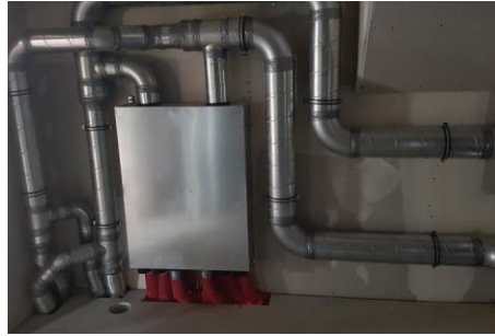
Figure 3: MultiPlexBox wall mounted