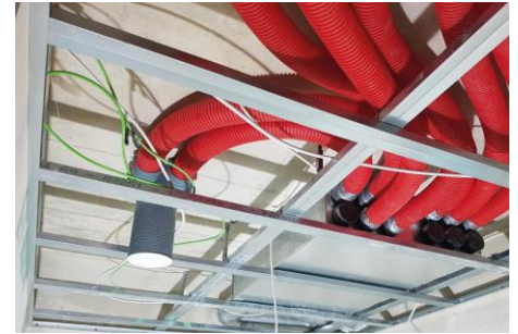
Figure 3: MultiPlexBox ceiling mounted